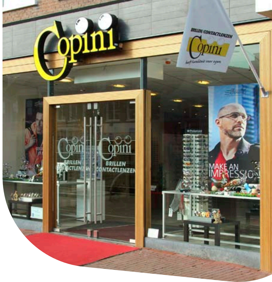
Copini Opticiens, Sneek, The Netherlands

Pilkington OptiView™ Protect can be bulletproof and even protect against bomb blasts by using certain glazing combinations.