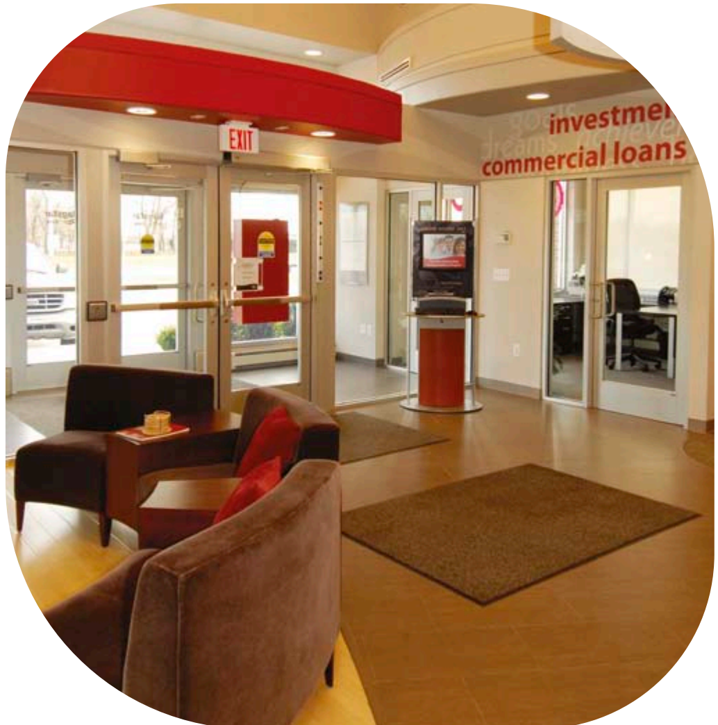
Flagstar Bank, Michigan, USA