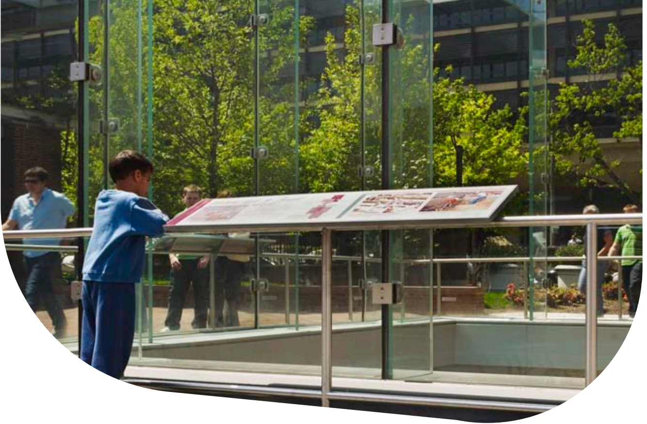
President's House, Philadelphia, Pennsylvania, USA