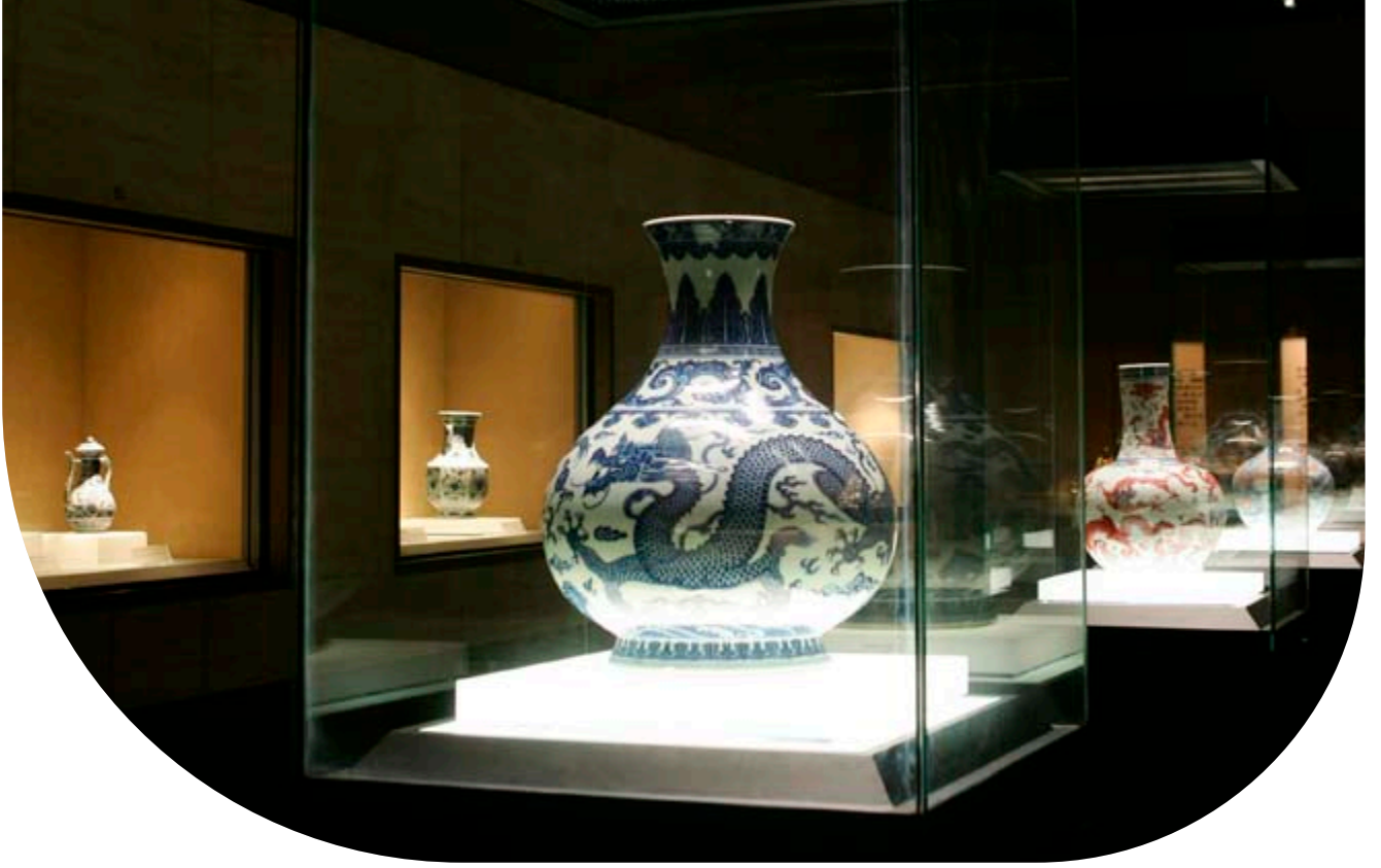
Beijing Museum, China