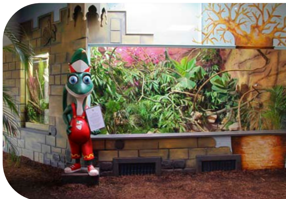
Zoo, Köln, Germany