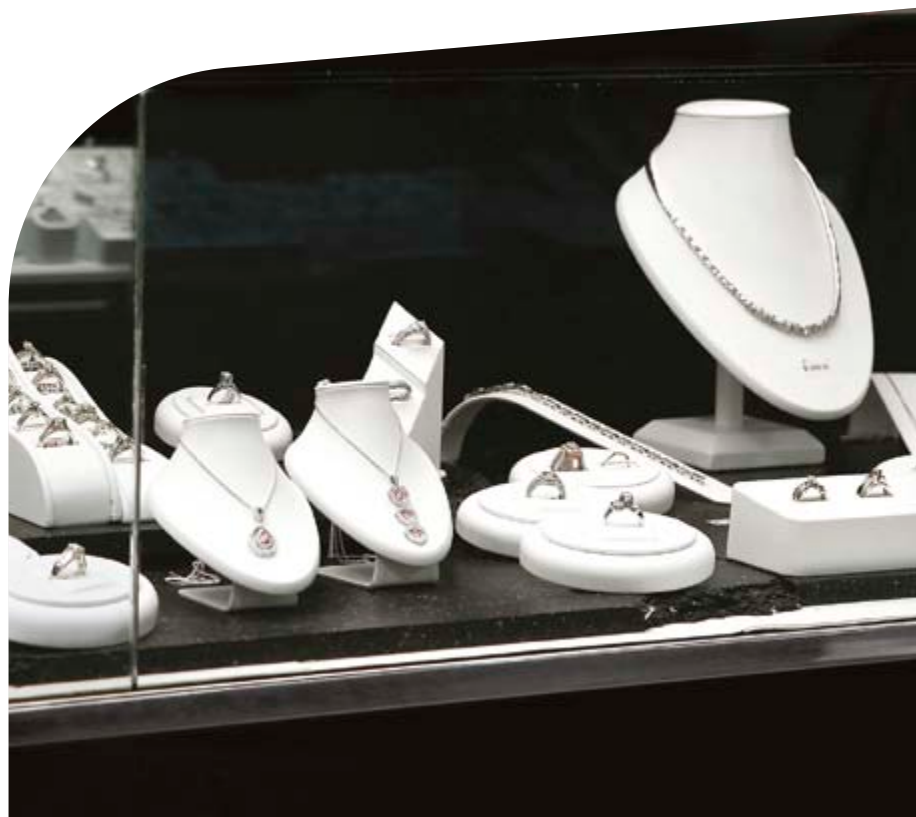
J. Foster Jewelers, Ohio, USA

Pilkington OptiView™ Protect provides an excellent barrier to noise. The laminated panes provide insulation against audio disturbances by dampening the sound.